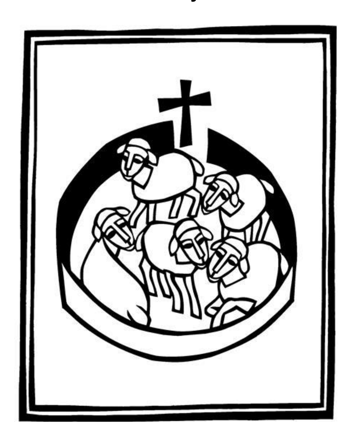
Sunday, April 21, 2024

Lutheran Church of the Living Christ 2725 Concord Drive Florissant, MO 63033